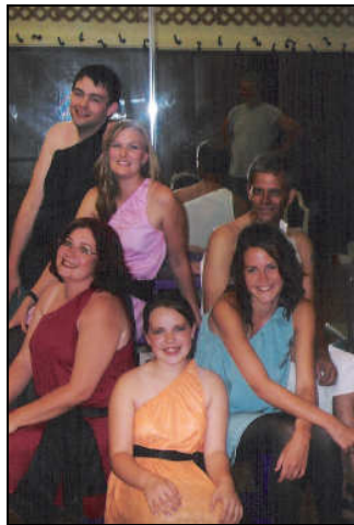
Cast of Pippin, 2007