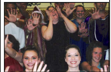
Cast of Pippin, 2007