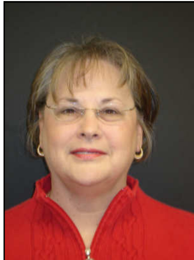
VISTA Coordinator for Hoopeston Main Street Program and RCDI Grant

Goal 1: To encourage and promote increased entrepreneurship training among the youth (middle and high school) in Hoopeston