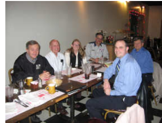
Weekly Economic Development Committee Meeting

Recognizing the impact the decline of manufacturing was