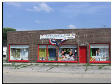
Visit Haga's Party Options at 210 North Market or online at www.partyoptions.net